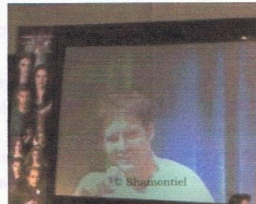
Peter Facinelli sits centerstage in front of Twilight fans.